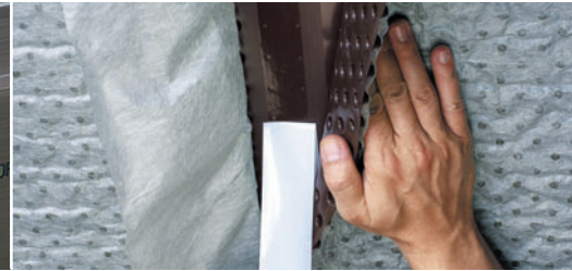
"Wallpapered" straight off the roll.