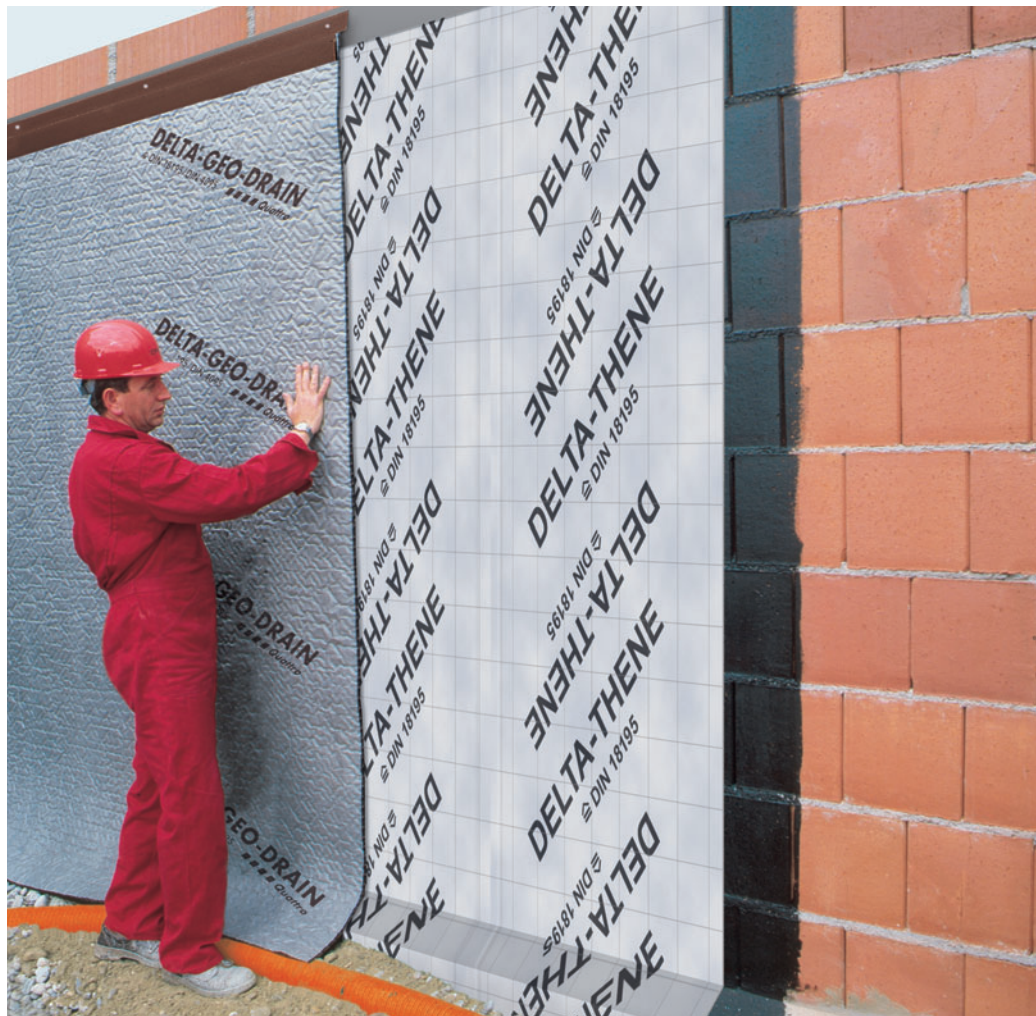
DELTA®-GEO-DRAIN Quattro and DELTA®-THENE are designed for swift installation.