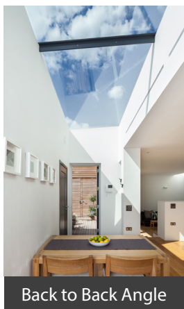
Back to Back Angle