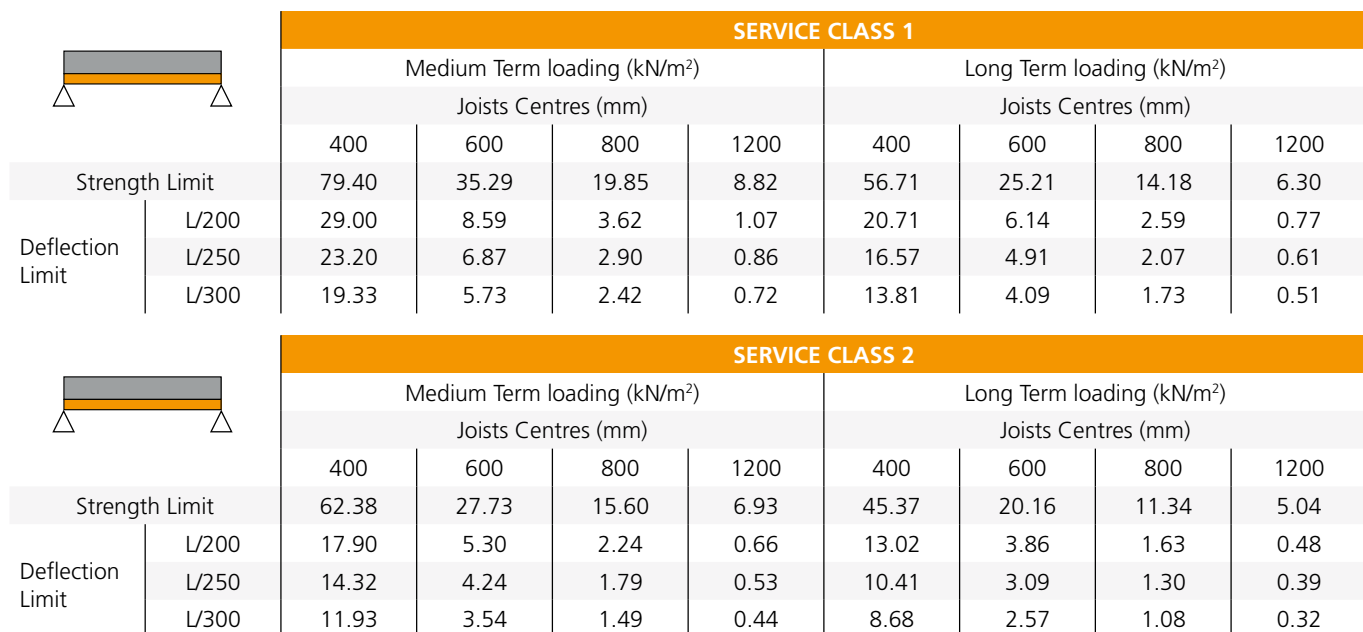
Table 3(b): UDL Load-bearing capacities (Double span)